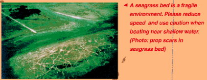
A seagrass bed is a fragile environment. Please reduce speed and use caution when boating near shallow water. (Photo: prop scars in seagrass bed)